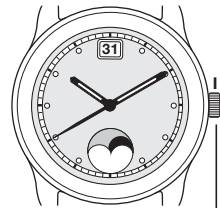
Normal running of watch